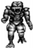
Assault Troops THE ASSUALT TROOPS!

All Aliens are not created equally. But Duke Nukem is a democratic type of guy...he'll kill them all. "With Frags and Justice for all"!