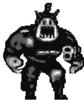
Pig Cop If you smell bacon, it must be a PIG COP!