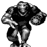
Enforcer Make sure you lay down the law with these ENFORCERS!