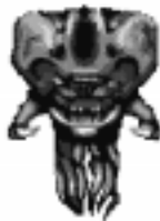
Octabrain You don't have to be smart to know that these OCTABRAINS must die!!