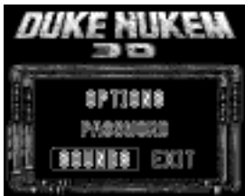
THE OPTIONS SCREEN

If you select OPTIONS on the DUKE NUKEM Title Screen, you'll be able to change the options that affect your game.